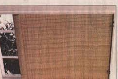
Kwikfit Trimmable Bamboo Blind, by Versailles Home Fashions, at Home Depot.

Bamboo's natural colour is blond, but you can purchase "carbonized" or smoked bamboo, which is naturally darker in tone. Colours are also possible, but keep in mind that adding colour to the bamboo makes it a little softer.