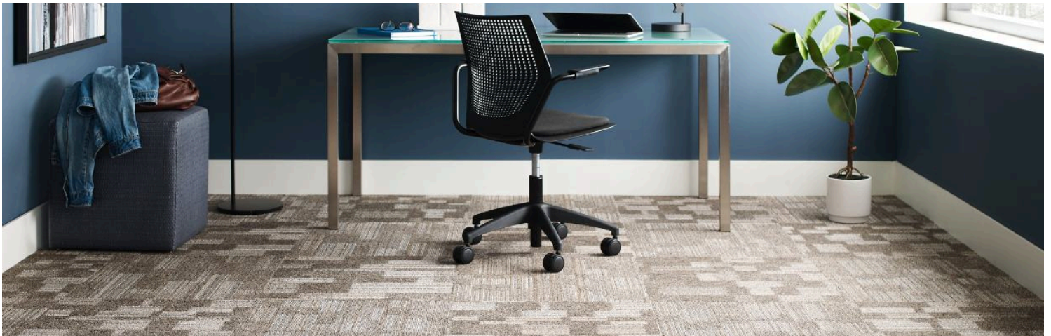
The Lynx Collection - Prowl

*The use of Commercialon modular adhesives is required to receive lifetime warranties associated with the backing system